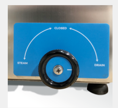
Detail of the 3 position manual valve installed in both AES-8 and AES-12.